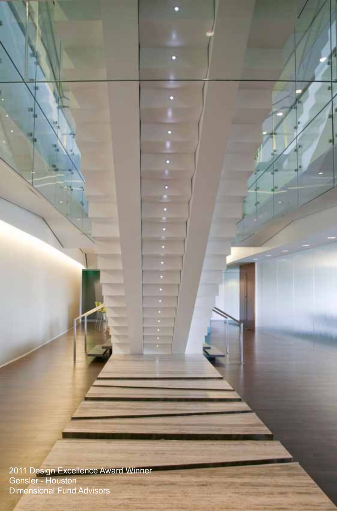
2011 Design Excellence Award Winner Gensler - Houston Dimensional Fund Advisors