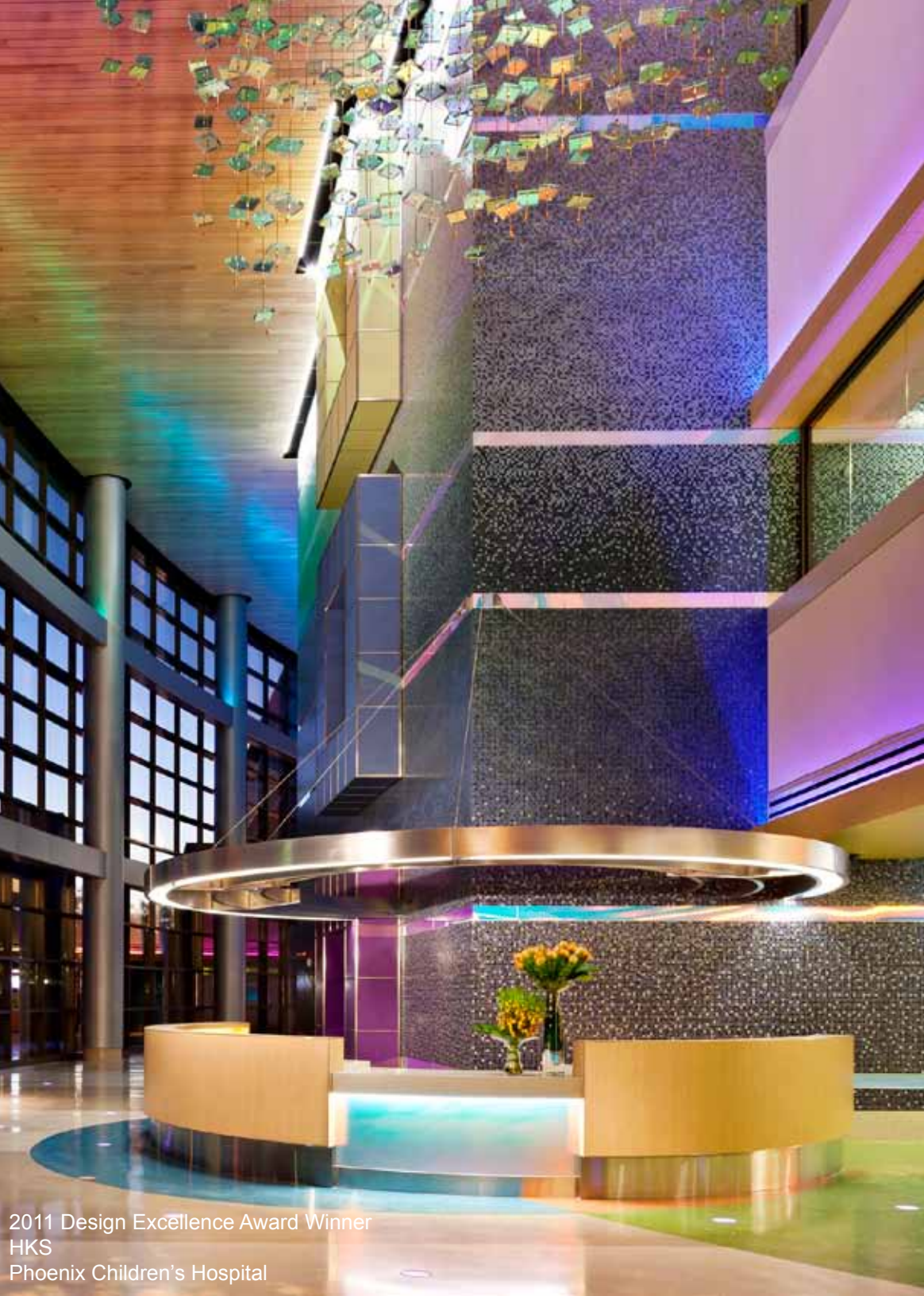
2011 Design Excellence Award Winner HKS Phoenix Children's Hospital