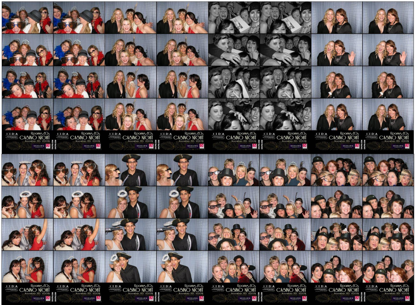
Photo Booth photos can be viewed online at www.okcfb.com Click on the Event Pictures and find the IIDA folder.