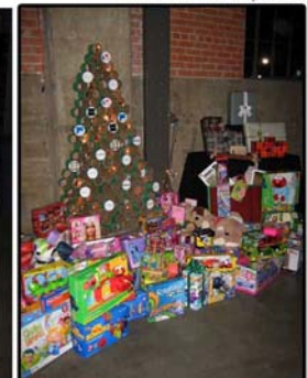
tree loaded with gifts donated to toys for tots