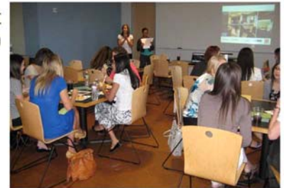
_____ student event perkins + will, october.09